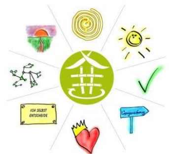
BAMBOO RESILIENCE TRAINING FOR WORK