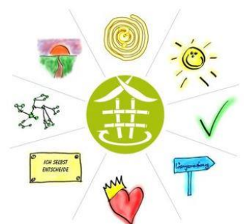
BAMBOO RESILIENCE TRAINING FOR WORK